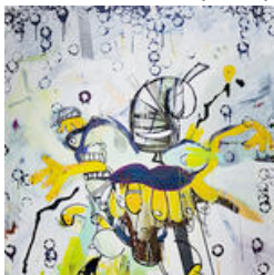
Downsizing at the call center might make you rethink your feelings about telemarketers.

Where: McMurtrey Gallery, 3508 Lake, 713-523-8238.