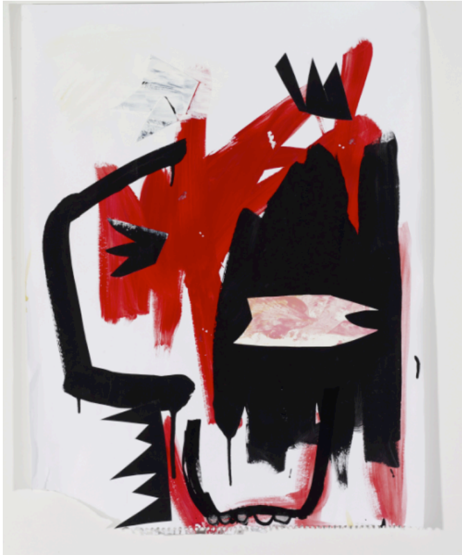
( http://glasstire.com/2011/10/04/howard-sherman-at-mcmurtrey-gallery/hs-250/ ) Howard Sherman, "Champion island in the Mainstream," 2011, acrylic and marker on paper, 24" x 18"