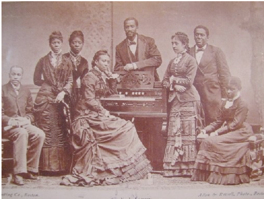
Fisk Jubilee Singers