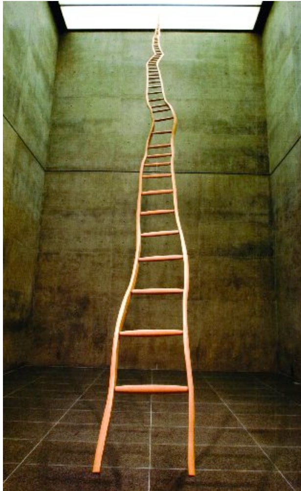
Martin Puryear, Ladder for Booker T. Washington , Modern Art Museum of Fort Worth