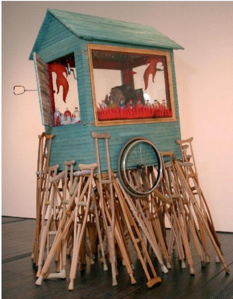
Pepón Osorio, Lonely Soul , 2008, courtesy of the artist

Honorable mentions: Cinema Remixed & Reloaded: Black Women Artists and the Moving Image Since 1970 and Every Sound You Can Imagine at CAMH; Wine, Worship and Sacrifice: The Golden Graves of Ancient Vani at the MFAH; American Art Since 1945: In a New Light at the McNay Art Museum in San Antonio and Howard Sherman: Eating Your Friction at the Art Museum of Southeast Texas in Beaumont.