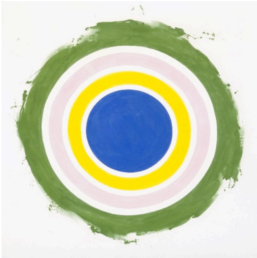
Kenneth Noland, Half , 1959