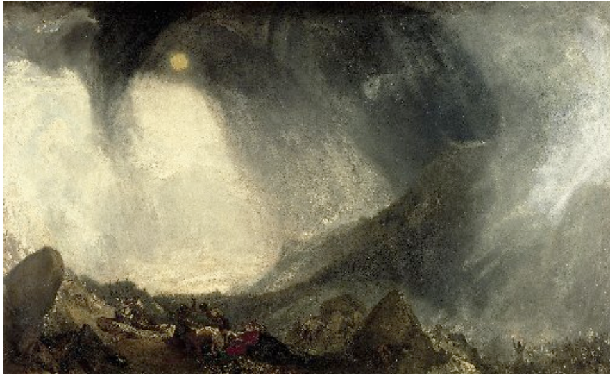
J.M.W. Turner, Snow Storm: Hannibal and his Army Crossing the Alps, 1812 , Tate London