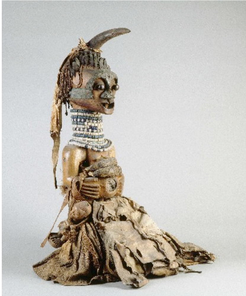
Male Figure, Songye, Democratic Republic of the Congo, Ethnographic Museum, Antwerp